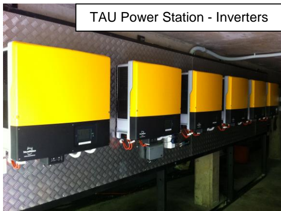
TAU Power Station - Inverters