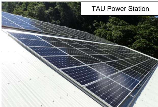
TAU Power Station

We commenced the project in September 2012 and it concluded on 18 th January 2013 with the grand opening of the Ministry of Education System by the Honourable Henry Puna (Prime Minister of the Cook Islands) and the Honourable John Carter (New Zealand High Commissioner).