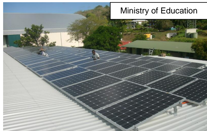
Ministry of Education